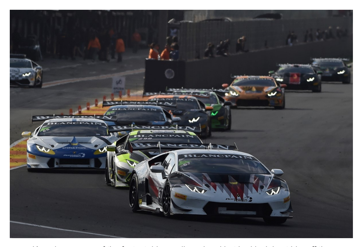
Krenzia was one of the fastest drivers all weekend but bad luck kept him off the podium in the World Final

After a chaotic opening lap their positions were reversed and Krenzia led the VSR pair in 9th place. As the pit window approached he became involved in an intense battle with Krebs which resulted in contact on lap thirteen. Liang got caught up in the accident and both cars lost time. Krenzia pitted immediately and lost a further thirty seconds for repairs to his Lamborghini. Liang pitted a lap later leaving bother drivers free to race to the flag. Liang made good progress through the field and closed the race in 6th place whilst Krenzia recovered to 9th despite a time penalty for his contact with Krebs.